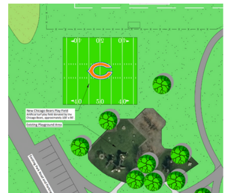
Rendering of Future Turf Field in Rockford